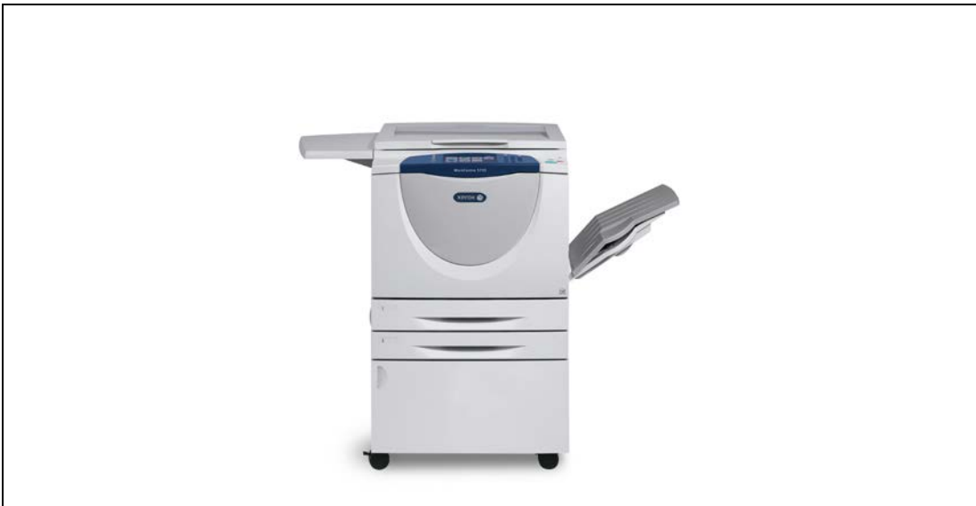
Figure 1: WorkCentre® 5735/5740/5745/5755/5765/5775/5790 with FIPS 140-2 Compliance over SNMPv3

The TOE can integrate with an IPv4 network with native support for DHCP. The hardware included in the TOE is shown in the figure below.